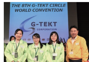
Members of the E Sao Er Guang Circle

QC circles selected from all over the world gather together for the G-TEKT Circle World Conference. At the eighth annual conference in FY2018, APAC (China) E Sao Er Guang Circle won the highest award. This is the first time that an overseas-based circle has won the highest award. The circle developed and introduced a general supply management system from scratch. As a result, they succeeded in reducing the 11.5 hours of working time by 88%. In addition, the system was introduced across the business locations in China.